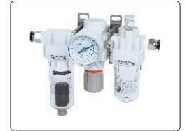
air filter (included)